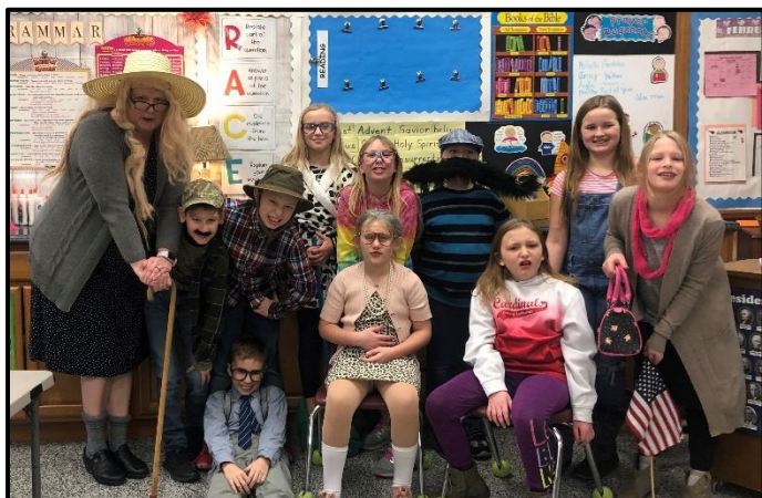
100 days smarter in 3rd grade

The goal of the program is to unleash confidence through accomplishment while establishing a lifetime appreciation of health and fitness. The girls will meet after school on Tuesdays and Thursdays at Trinity Lutheran School. If you are interested, please sign up soon so they know there are enough participants.