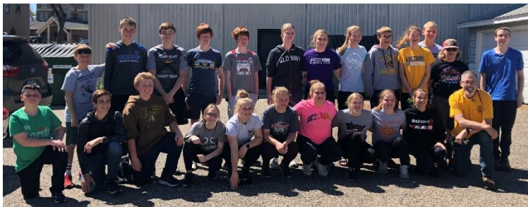
Ditch Clean Up Crew

Thank you to those who brought in chapel offerings in April, we were able to send $134.60 to Camp Omega.