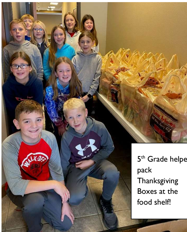
5 th Grade helped pack Thanksgiving Boxes at the food shelf!

Food Shelf Tuesday Thank you for all the donated food for the Janesville Food Shelf! It was a wonderful assortment. $26.11 was also collected.