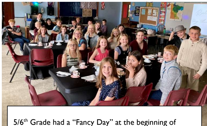
5/6 th Grade had a "Fancy Day" at the beginning of November. Learning a little etiquette and having fun.