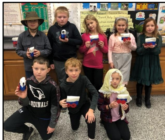
Holding handmade covered wagons