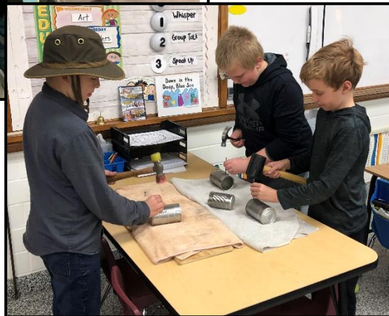
Making tin-punched lanterns