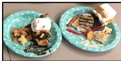
Covered wagon snack – messy but yummy 😊