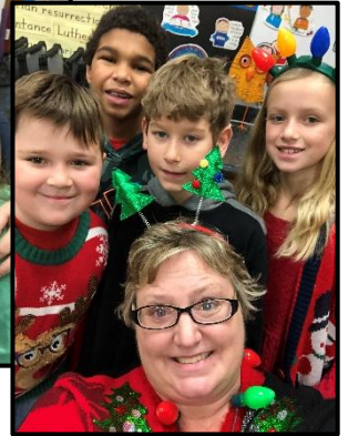
3 rd Grade