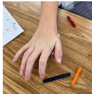
Using palms to apply the pressure.

Rock Cycles Our 6th graders recently studied the rock cycle, a process in which rocks are continuously transformed between the three rock types: igneous, sedimentary, and metamorphic. They modeled the rock cycle using crayon shavings and adding pressure and heat to see how our "rocks" changed!