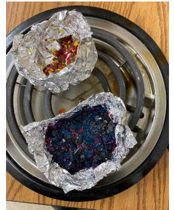
Heating the minerals.