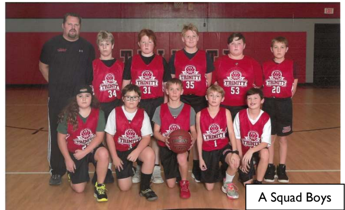
A Squad Boys