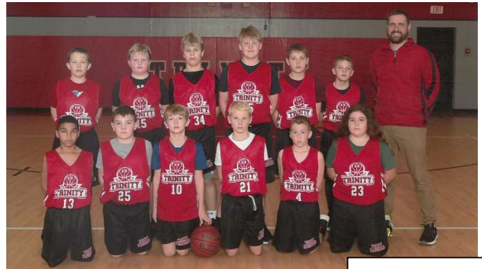
B Squad Boys