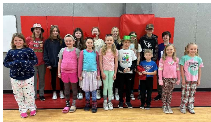
The top two classroom winners in each grade 1-8 participated in Trinity's Spelling Bee on March 10:

Look for letters coming home for those who placed 1 st and 2 nd in each class. 1 st place students will be invited to the 45 th Annual Spelling Contest for Lutheran elementary schools in southern Minnesota on Saturday, April 22 nd , at St. Paul's Lutheran School, Truman. Their alternates are the students who placed 2 nd in their class.